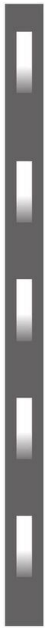
TYPICAL FLOOR PLAN SECOND TO ELEVENTH FLOOR